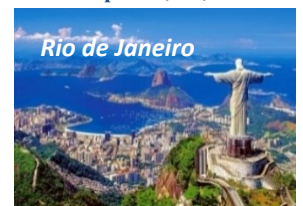
Rio de Janeiro

14 Day Multicultural trip through the hottest corners of South America, Rio de Janeiro with its golden beaches and most famous monument of Christ the Redeemer (one of Wonders of the World), waterfalls in Iguazu, in the tango rhythm in Buenos Aires, through colorful Santiago de Chile, to a 4-day escapade to Easter Island with mysterious Moai Statues. Departure date in 2019: Oct. 26 - Nov. 8; $ TBD