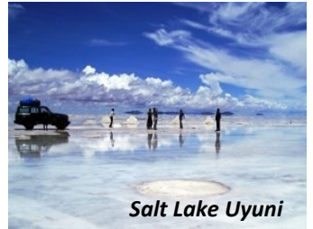
Salt Lake Uyuni

11 Days: Lima, Arequipa, Colca Canyon, Puno, Lake Titicaca, Raqchi, Cuzco, Ollantaytambo and Machu Picchu (one of 7 Wonders of the World). The fantastic tour of Peru's best attractions for those with little vacation time! Guaranteed departure date in 2018: Oct. 12-22; Nov. 16-26; 2019: Apr. 26-May 6; Jun. 28-Jul. 8; Aug. 16-26; Oct. 11-21, Nov.8-18; $2,290 in DBL